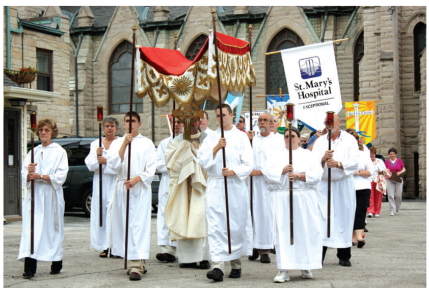
Saints James and Patrick Parish, Decatur IL. Diocese of Springfield in Illinois

These images will help this design and fabrication task.