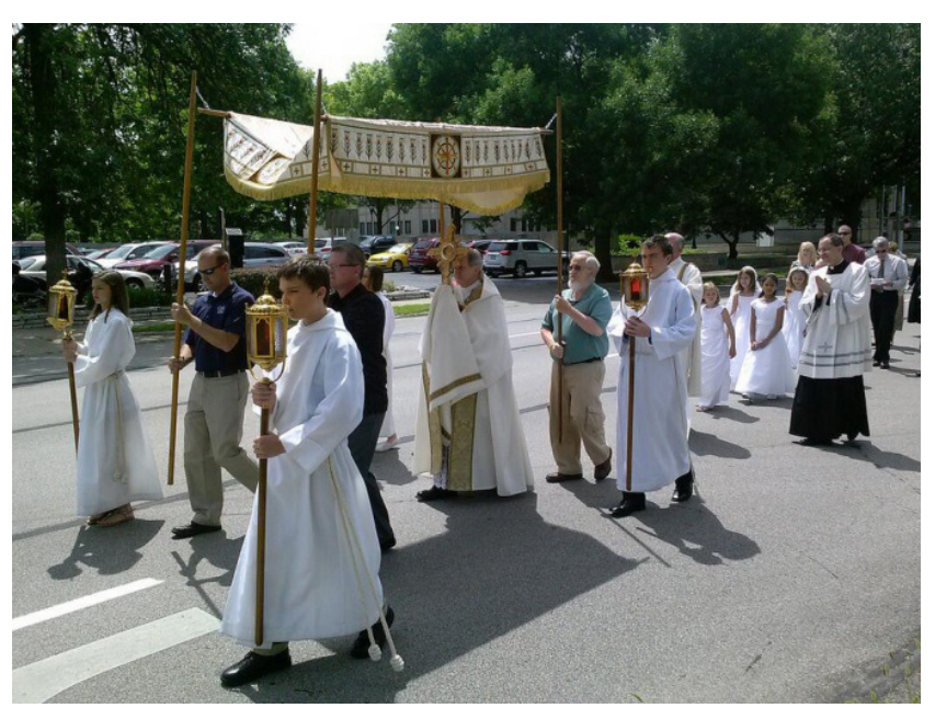
Cathedral of the Immacultate Conception, Springfield IL Diocese of Springfield in Illinois 2014