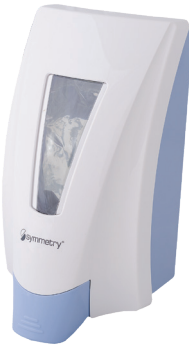
1250 ml Empathy