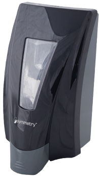
1250 ml & 2000 ml Prestige