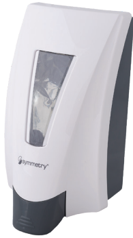
1250 ml & 2000 ml Alpine